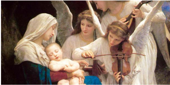
William Adolphe Bouguereau 1881