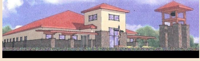
2013 - Present