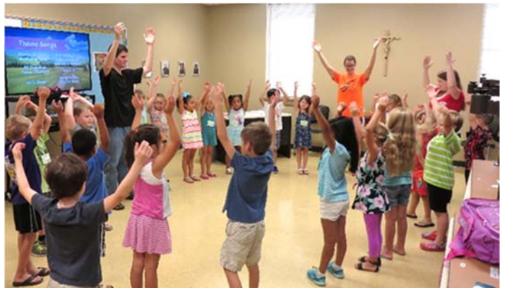
(below), and snacks (below). All of the activities each day centered

around the theme of the day, and the theme of the week – Jesus Gathers Us Together.