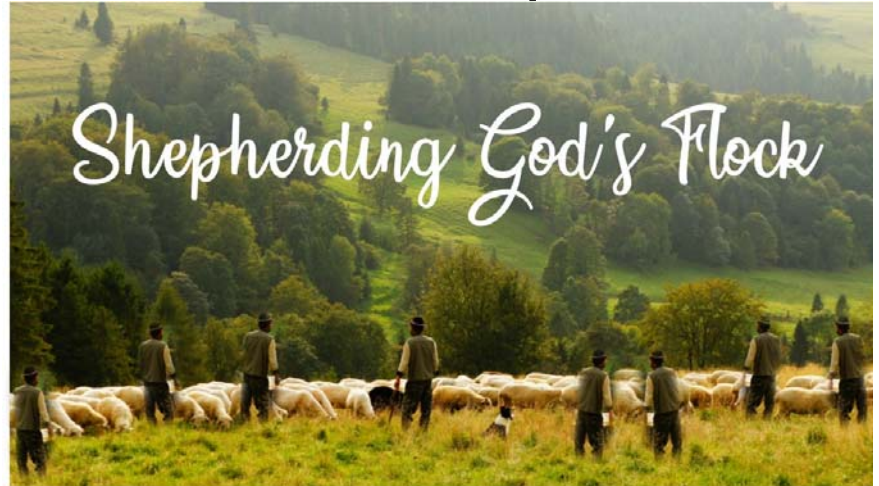
Tend the flock of God in your midst." 1 Peter 5:2