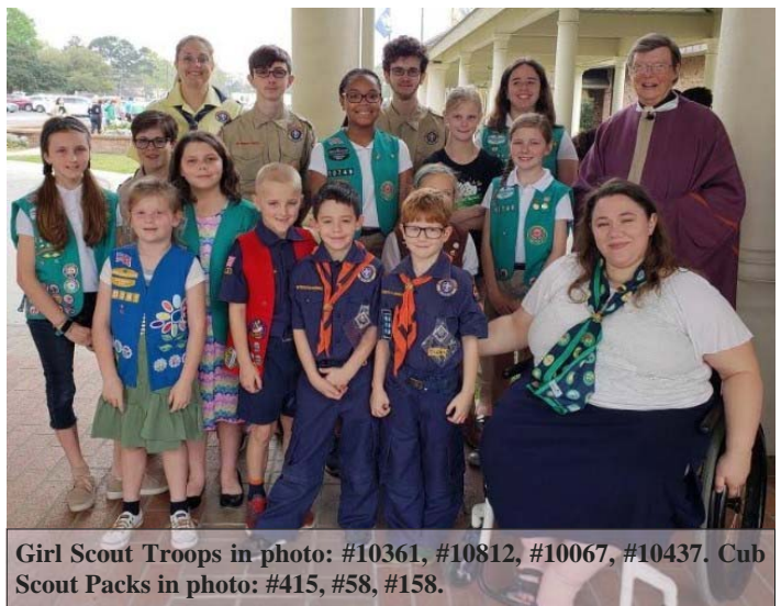
Girl Scout Troops in photo: #10361, #10812, #10067, #10437. Cub Scout Packs in photo: #415, #58, #158.