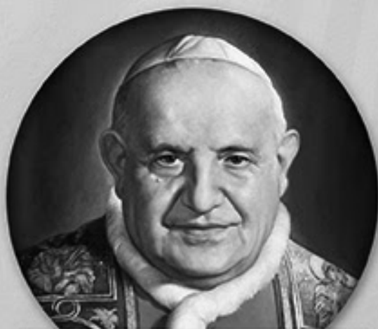
Saint John XXIII