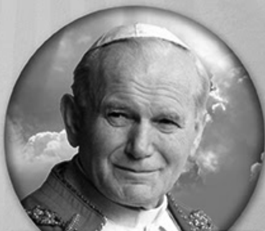
Saint John Paul II