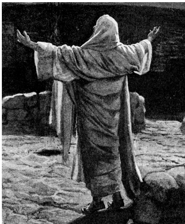
Christ going to the Mount of Olives at night, by James Tissot, 1856-1902

tends to deny that there is such a thing as real right and wrong. It tends to equate whatever one likes with being right and good, and whatever one doesn't like with being wrong and bad. How on earth did we get such an idea of human freedom? To answer this question, we must turn to consider what kind of morality lies behind this understanding of human freedom.