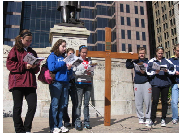
12th Station of the Cross at the Statehouse Hundreds of Catholics from around the diocese will participate in the annual Good Friday Walking Stations of the Cross.