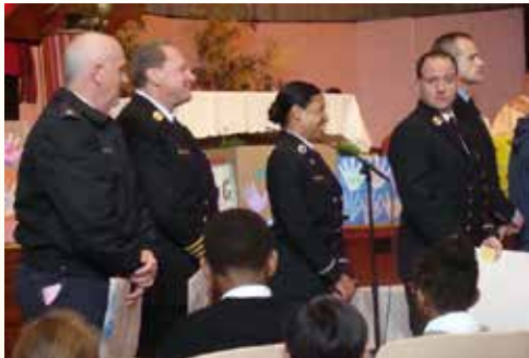
FDNY Mass of Appreciation