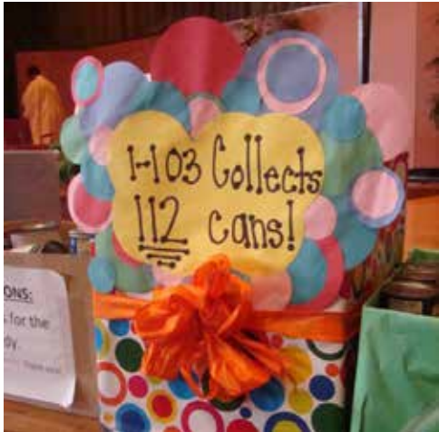
Feeding Our Neighbors