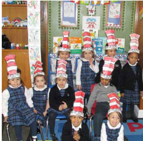
Pre-K3 Celebrates Dr. Seuss's Birthday