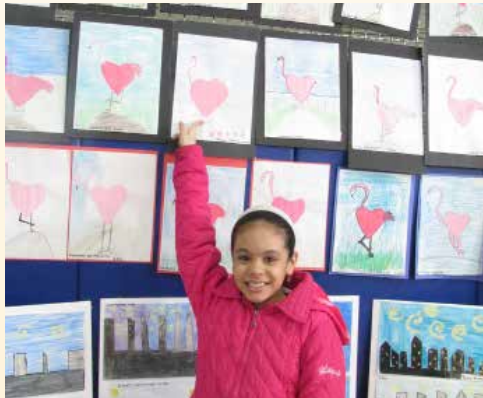
Parish Art Show