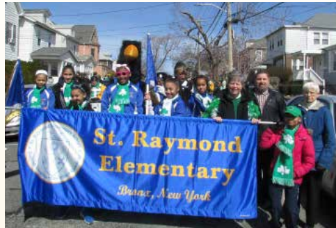
McLean Ave. Yonkers St. Patrick's Day Parade