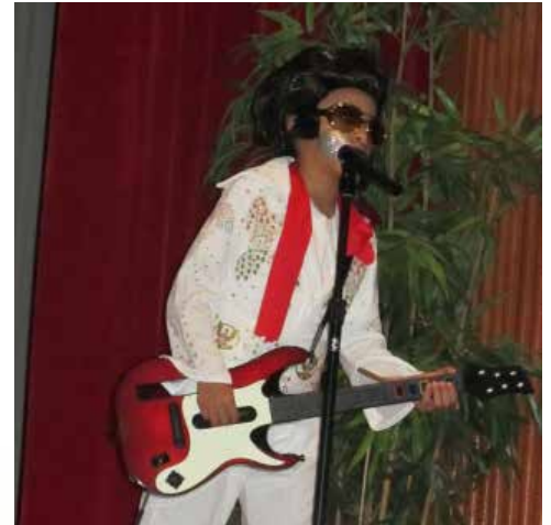
Spring Show Elvis Sings