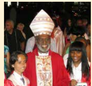
Confirmation Celebrant Archbishop Charles Palmer-Buckle