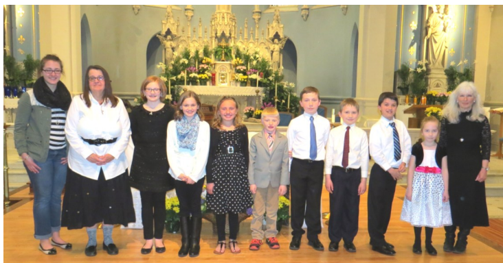
Participants from last year's recital.

There will be a light reception after the program.