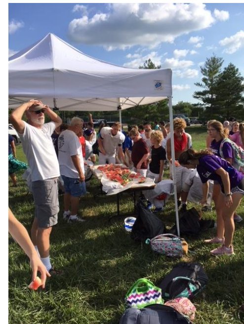
The annual Knights of Columbus Watermelon Feed for all junior high and high school athletes, another great community event!