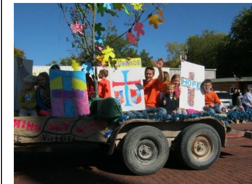
Annunciation Maple Leaf Float put together by the Religious Education teachers & kids.