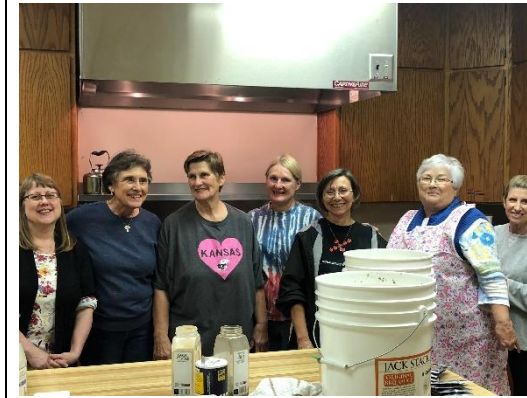
It begins here...the ladies from Annunciation & St. Francis working together making chili!