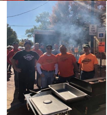
"Everyone working together for the success of the Maple Leaf Festival!"