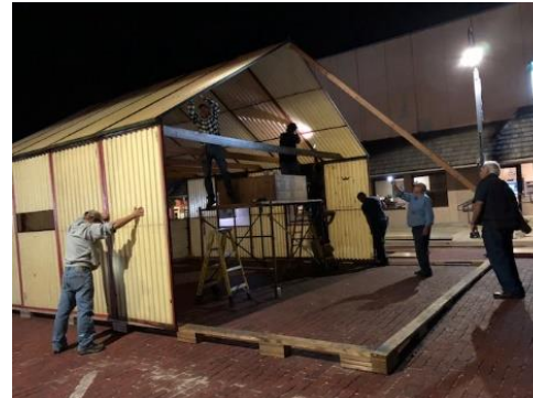
Building set-up from start to finish. Many thanks to our Annunciation and St. Francis men who helped set it up!