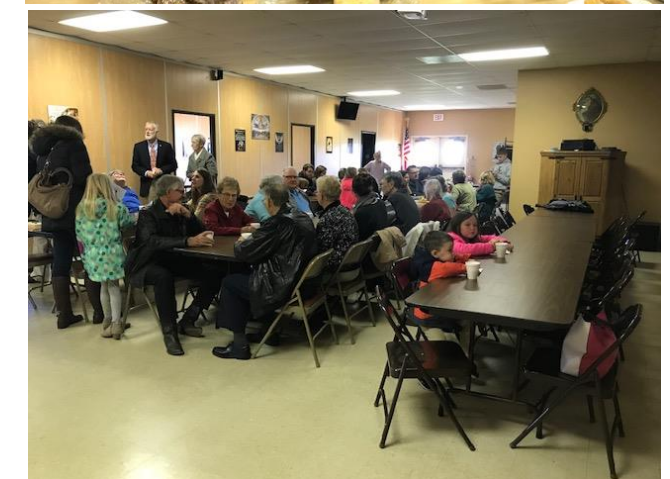
Many enjoying donuts and fellowship at Annunciation!