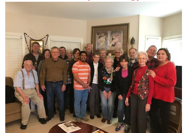
Celebrating the Spirit of Christmas with our Methodist friends!