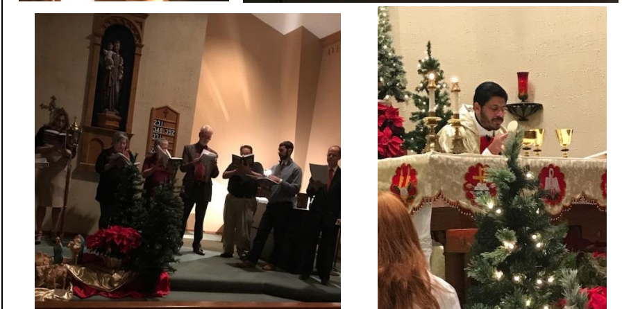
Christmas Eve at Annunciation

"Fall on your knees, O hear the angel voices! O night divine, O night when Christ was born! O night, O holy night, O night divine!"