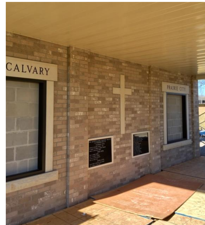
Looking so beautiful! With a little good weather it will be completed soon.