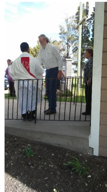
A BEAUTIFUL SUNDAY AT ST. FRANCIS!

We teach these skills in Every Day in Love! Register now for June: www.archkck.org/everyday