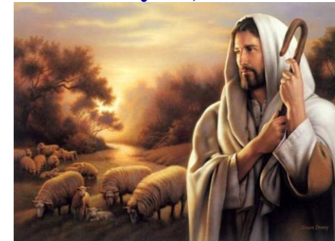
"My sheep hear my voice"