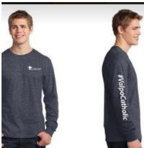
Gildan Hammer Shirt Unisex Long Sleeve Shirt (right) Color: Heather Navy Sizes: Adult Cost: $15

Please note that the St. T's office will close at noon on Thursday, November 8 and reopen on Monday, November 12, 2018. Thank you for your understanding.