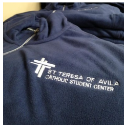
Port Authority Unisex Fleece Jacket with logo Color: Navy Sizes: Adult Cost: $25