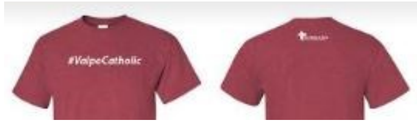
Front: #ValpoCatholic Back: St. T Logo Gildan Hammer Shirt Unisex Short Sleeve Shirt Color: Heather Cardinal Sizes: Adult Cost $10

Looking for a way to show your St. T's SPIRIT? Last Chance!!!! Place your order at saintt.com by November 5, 2018!