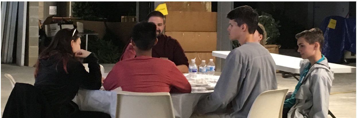
Photos from the Sunday, September 30th meeting.