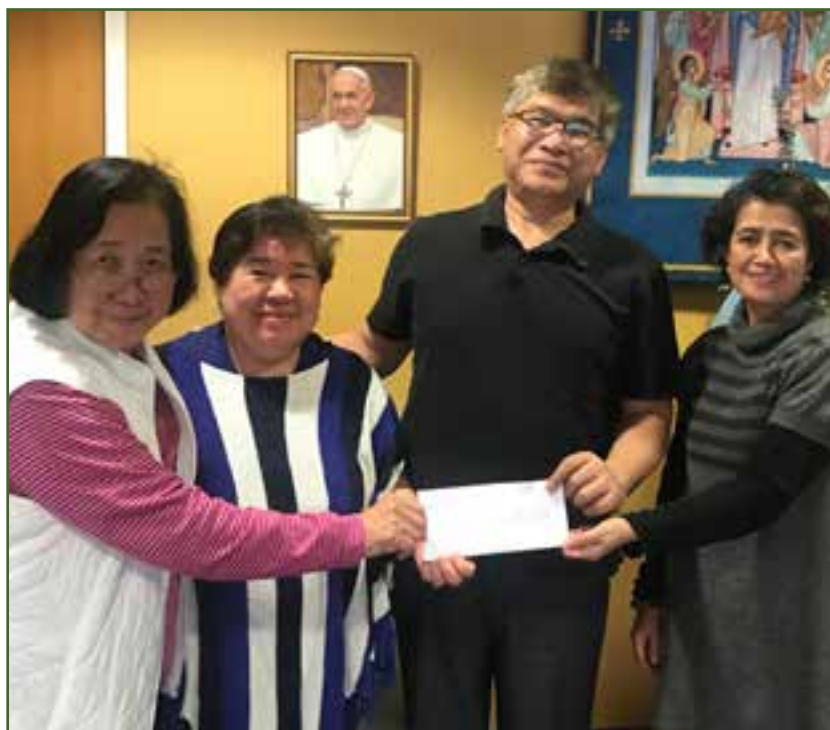
Thank you the Legion of Mary who donated $1,210.00 to the bells project

Top of page two / Parte superior de la pagina 2