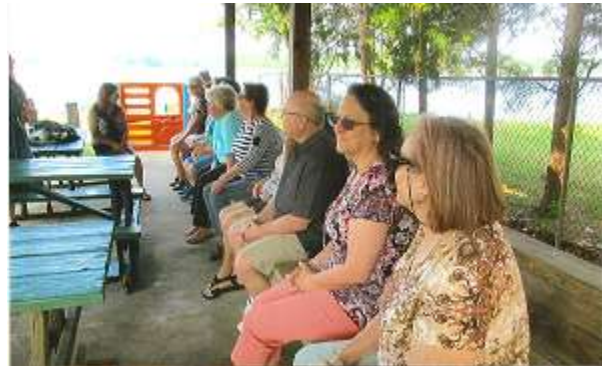
A very solemn and sad situation