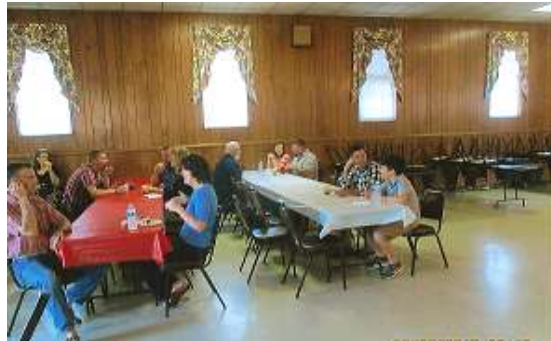
Parishioners, Knights and their Family's enjoying the Social