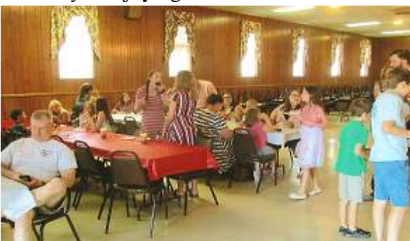
Just enjoying and socializing