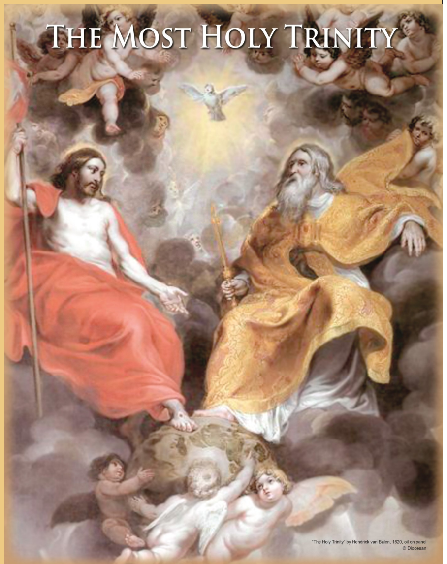
"The Holy Trinity" by Hendrick van Balen, 1620, oil on panel