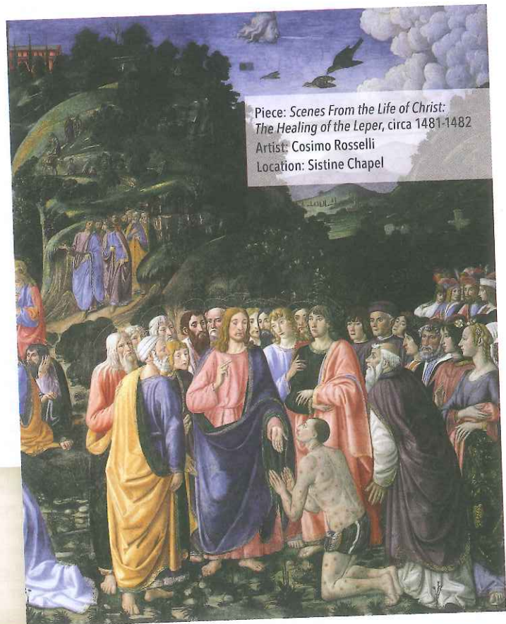
Piece: Scenes From the Life of Christ: The Healing of the Leper , circa 1481-1482 Artist: Cosimo Rosselli Location: Sistine Chapel