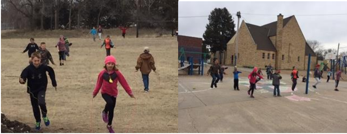
Students participating in 'Jump Rope For Heart' activities this spring!