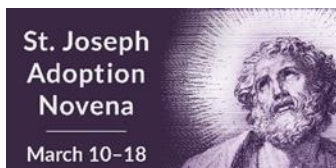
St. Joseph Adoption Novena March 10-18