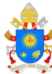
Pope Francis Vatican City State