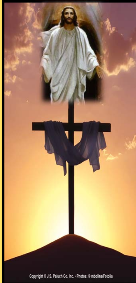
Copyright © J.S. Paluch Co. Inc.

Ottmar Tovar-Almanza -Communications & Bulletin Editor-