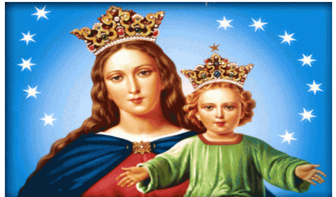
Picture from Cathedral of St. Matthew the Apostol, 1725 Rhode Island Avenue, NW

To Nativity Youth! Some of our young people who attend CCCPS Brightwood won 1st Place in a choir concert/competition. A free concert was held last Sunday at St. Martins parish on North Capital Street! God bless our kids!