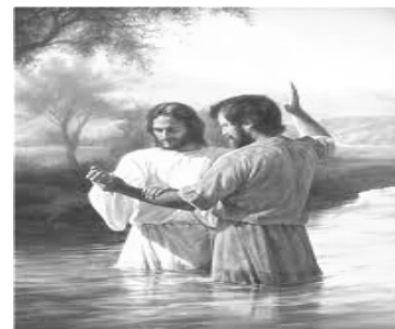
June 24th—Nativity of St. John the Baptist The Cousin Who Baptized Jesus