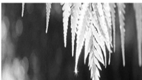
Leave a little bit of you in our community