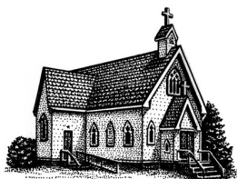
St. Timothy—Campobello Isle, NB