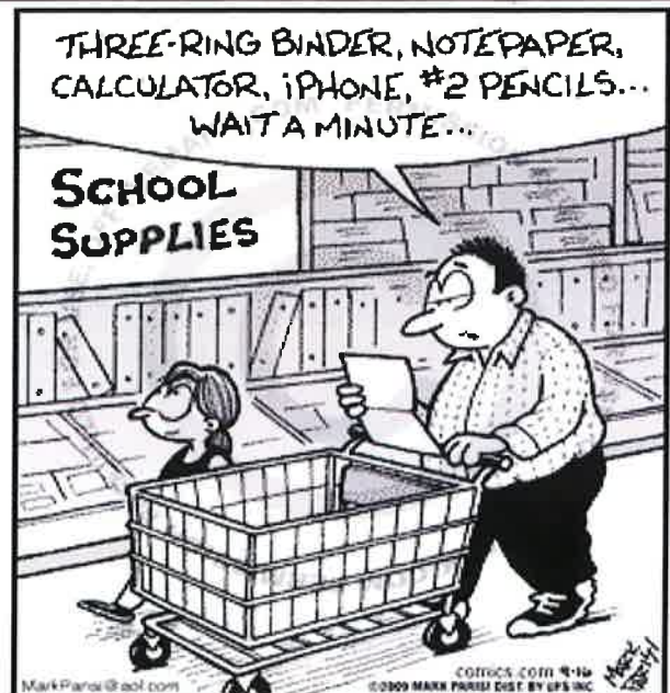
© Mark Parisi, Permission required for use.