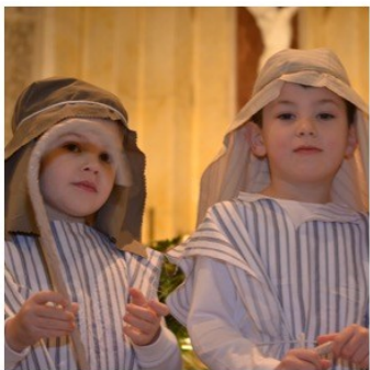
PreK Christmas Pageant