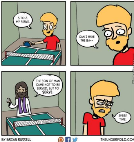
BY BRIAN RUSSELL THEUNDERFOLD.COM