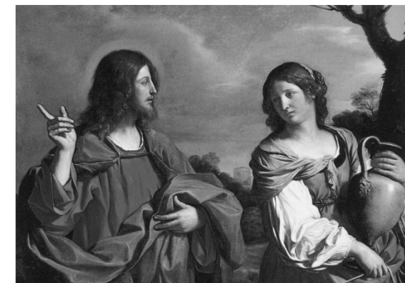
The Samaritan woman at the well