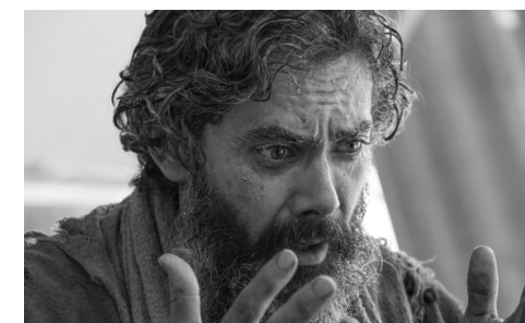
Jesus heals the man born blind John 9,1-12)

The Second Scrutiny Fourth Sunday of Lent March 31, 2019