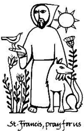
St. Francis, pray for us

This Saturday is the Feast of St. Francis of Assisi. St. Francis is one of our most beloved saints in the Communion of Saints. We are blessed in the Mankato area and especially at our area hospital that greeting us in the entrance is a