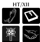
HT/XII Youth Group

Grades 7-12: Are you ready for another great TV game show? This month it will be Faithful Feud . Start watching re-runs of Family Feud and reading up on your Bible. Who will walk away with the million dollar prize?!