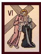
A woman, Veronica, wipes Jesus' face.