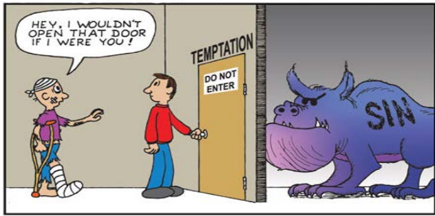
If you do what is right, will you not be accepted? But if you do not do what is right, sin is crouching at your door; it desires to have you, but you must rule over it. — GENESIS 4:6-7