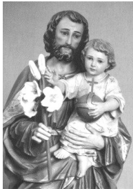
March 19 FEAST OF ST. JOSEPH, Spouse of the Virgin Mary

Bobcat Catholics like you provide more than half the resources necessary to bring students of Texas State closer to Christ. Contact a staff member anytime to join our mission at 512-392-5925 or giving@txstatecatholic.org