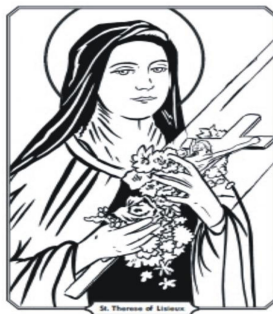
In service to one... In service to all

Thursday 9/22 - 9:45 -10:00AM Friday 9/23 - 9:45 -10:00AM Saturday 9/24 - 9:45 -10:00AM Sunday 9/25 - 9:15 - 9:30AM Monday 9/26 - 9:45 -10:00AM Tuesday 9/27 - 9:45 -10:00AM Wednesday 9/28 - 9:45 -10:00AM Thursday 9/29 - 9:45 -10:00AM Friday 9/30 - 9:45 -10:00AM