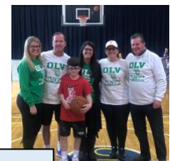
The 8 th Annual OLV Tom Hayden 3 on 3 Tournament.