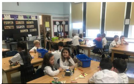
OLV’s spring Enrichment Club offerings include: Dance, Chess, Baton, STEM, Cooking, Crafting, Intramurals, Mock Trial, Sodality, Coding, Scooter Hockey, Beautiful Me and Lego Club.