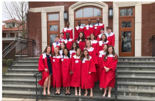
OLV’s Class of 2019 received the Sacrament of Confirmation recently.

OLV School entered spring with both the prayer and reflection the Lenten season brings, as well as the continued school spirit that abounds. Each Friday during Lent, our 5 th through 8 th graders attend the Stations of the Cross – yet another symbol of our students’ freedom to express their faith during the school day. In addition, our students’ accomplishments have been celebrated, our clubs have been bustling, traditions have continued. Here’s a peek at the latest goings on: