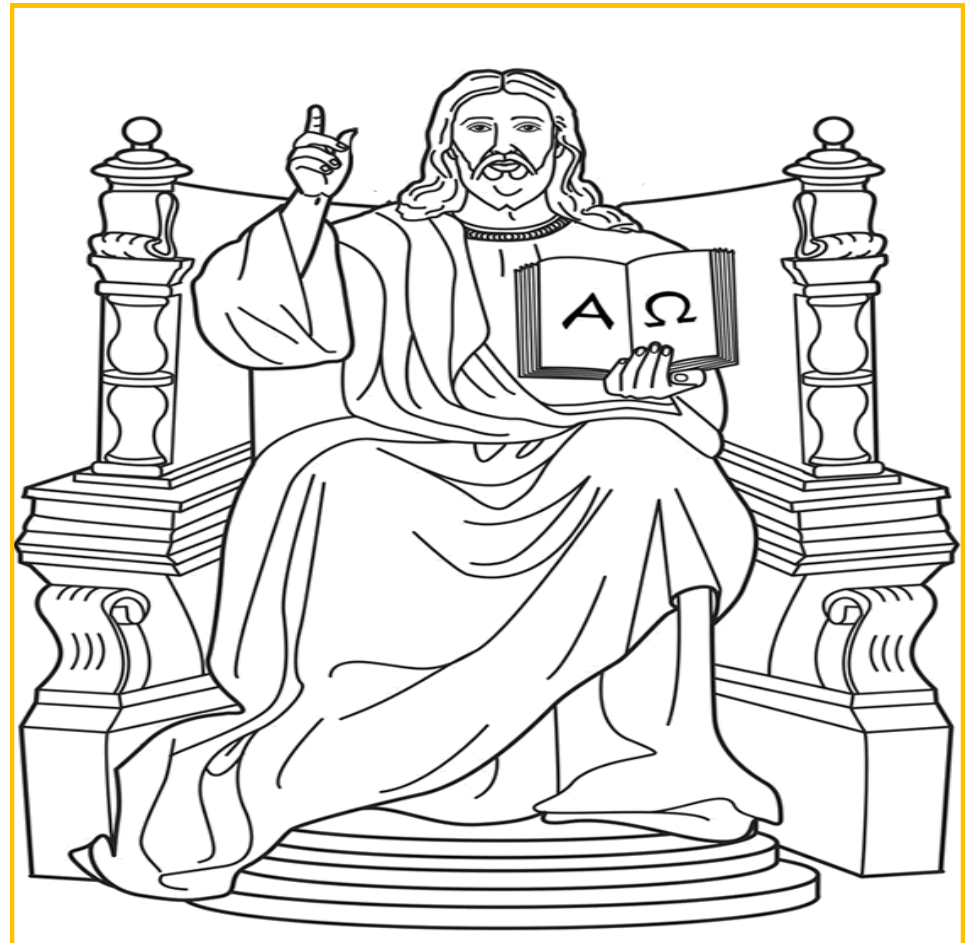
Christ the King