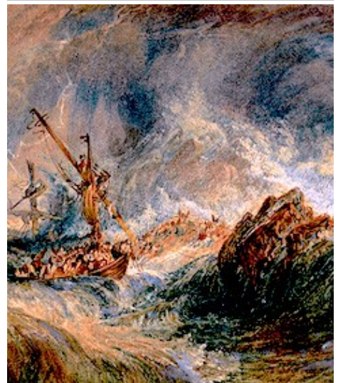
J.M. W. Turner, The Storm Shipwreck 1823, detail

Sunday Mass 11 am, 7:30 pm, 9:30 pm Weekday Mass Tuesday-Friday: 12:15 pm Adoration Mon-Wed-Fri: 8–9 am Thursday: 7-9 pm Confession Thursday: 7-9 pm or or by appointment