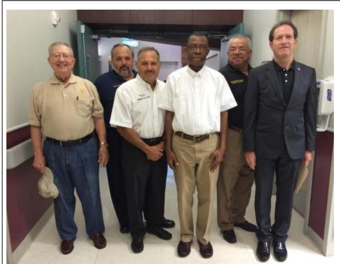
What a great looking bunch!