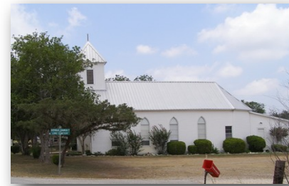
St. Aloysius Westhoff