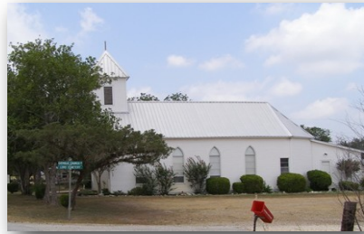
St. Aloysius Westhoff

Sts. Peter & Paul and St. Aloysius Catholic Churches 11220 FM 237, Meyersville, Texas 77974 Office Phone 361-275-3868 Fax 361-277-8972 Email: stsp@qvec.net Web: www.catholiccommunityofcuero.org