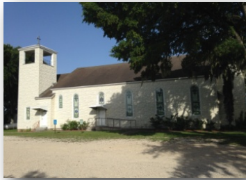
Sts. Peter & Paul Meyersville