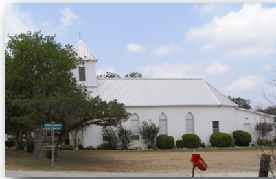
St. Aloysius Westhoff

Sts. Peter & Paul and St. Aloysius Catholic Churches 11220 FM 237, Meyersville, Texas 77974 Office Phone 361-275-3868 Fax 361-277-8972 Email: stsp@gvec.net Web: www.catholiccommunityofcuero.org