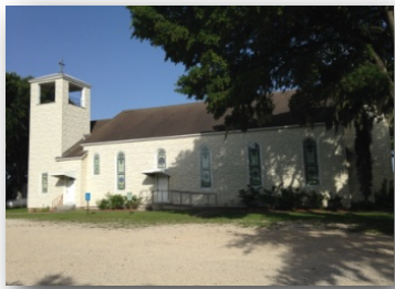
Sts. Peter & Paul Meyersville