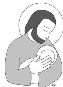
SAINT JOSEPH PRAY FOR US